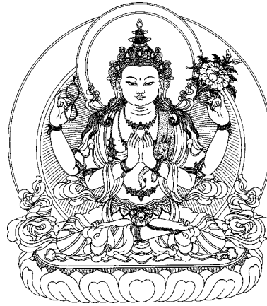
Chenrezi - the Embodiment of Compassion

Those that we now call enemies have been friends in past lives. Because their kindness is now history does not make it less than the kindness of our present friends. Moreover, although everyone we see now appears to be either enemy, friend or stranger, there is no certainty that they will always