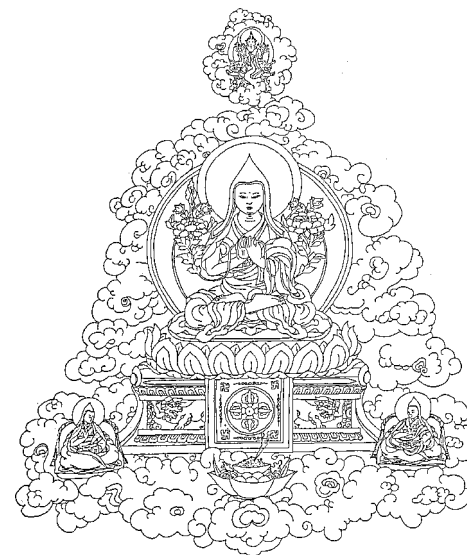
Lama Tsong Khapa and His Two Spiritual Sons, Khedrup Je and Gyeltsap Je