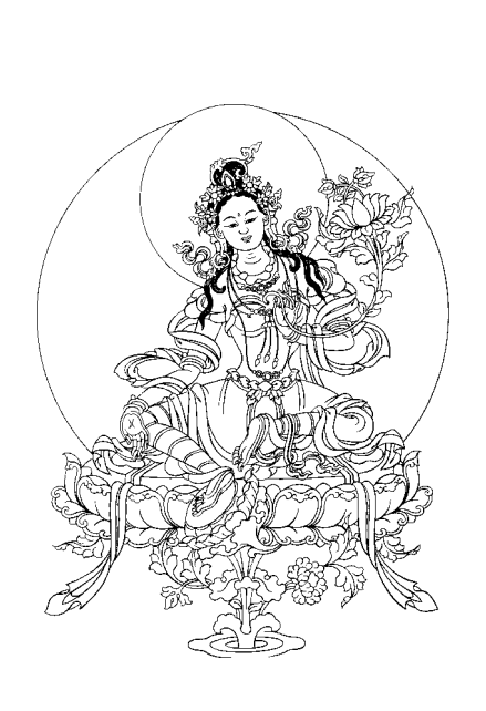
PRAISE AND REQUEST TO THE TWENTY-ONE TARAS